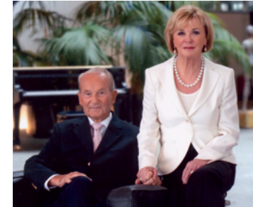
Reinhard and Liz Mohn